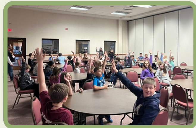
Peace Lutheran students playing invasive species musical chairs