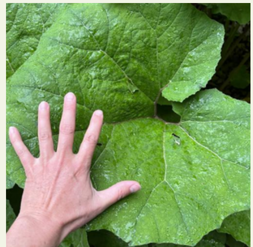
Butterfly dock flowers and leaves