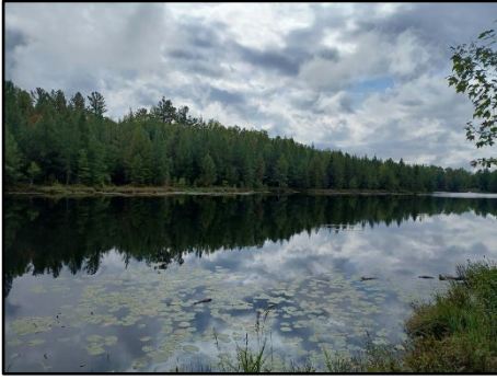
Shoestring Lake, Langlade County

Starting this year FLOW AIS will begin accepting fee for service work. Projects include, but are not limited to: