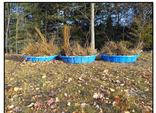
Overwintering purple loosestrife plant, in the backyard of FLOW AIS Coordinator Derek Thorns’s house

Derek Thorn and Lucas Obrien of Forest County Land and Water were able to get a head start setting up the purple loosestrife mass rearing cages at Nicolet College in Rhinelander again this year. The cages will fully be up before the first purple loosestrife plants begin to sprout in the spring. FLOW AIS is partnering again with WHIP, Vilas County and Forest County Land and Water, to continue their collaborative work rearing purple loosestrife beetles. The next steps for the collaborative will be to pot purple loosestrife plants to grow in the cage and collect starter beetles that will feed on the plants and multiply. Once there are thousands of beetles (hopefully) they will be released onto wild populations of purple loosestrife where the beetles will feed on the plants.