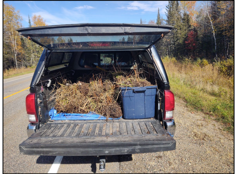
Truck bed full of purple loosestrife plants ready to be overwintered

they were able to dig that many plants as this was their first time digging at the location. The plants will be overwintering behind Dereks house in Rhinelander. Derek, Rosie, and Kayla Littleton plan to dig the remaining plants needed for overwintering at Seagull Bar in Marinette County. The group is hoping to have between 120-140 plants overwintering overall. The partnership is also looking for a new area to put their two cages up next year. A few ideas of new areas are being looked into at this time.