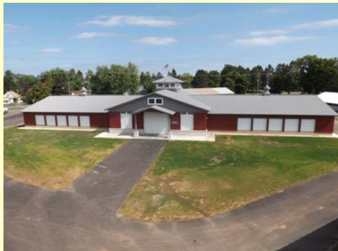
THE NEW LIVESTOCK PAVILION

Lessee will provide a Certificate of Insurance to the Fairgrounds Committee at least thirty (30) days prior to your event.